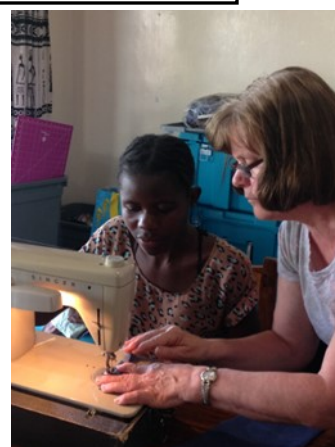
sewing machine training