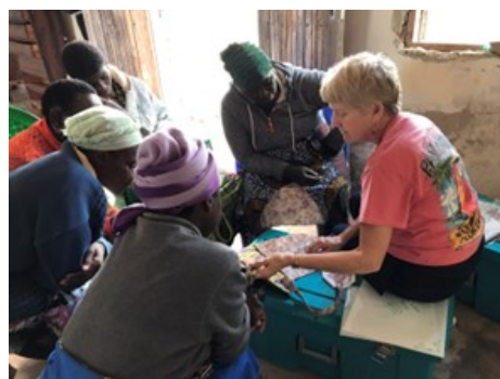
Training in Pantipurse construction