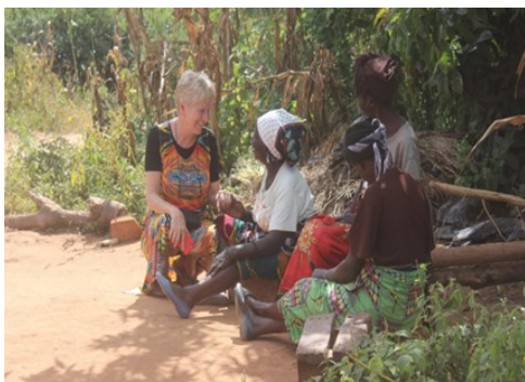
visiting widow Esnat and her daughters