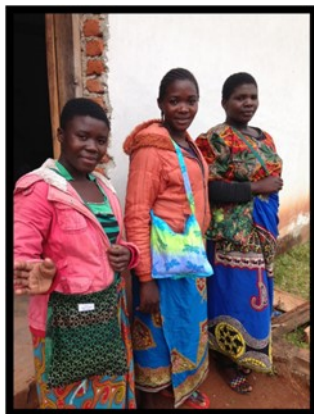
3 girls with Pantipack menstrual kits