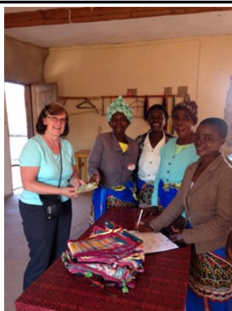
Earning money making kits