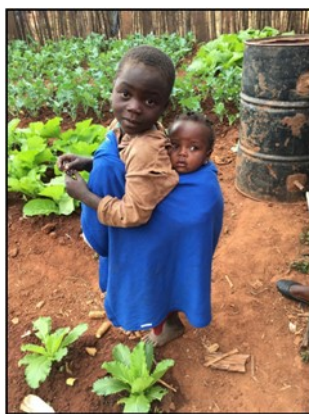
Widow's children in the garden