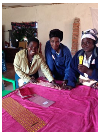
3 girls making flannel menstrual pads