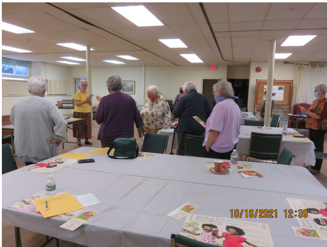
“Reading the Presbyterian Women's Purpose”