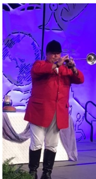
To the left is a bugle player at a plenary.