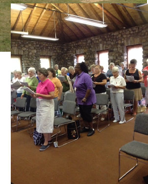
The people sing!