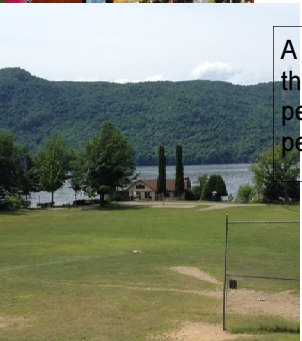
A view of the lake, perfectly peaceful